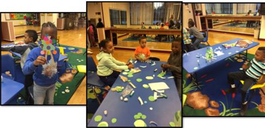
Making paper trees