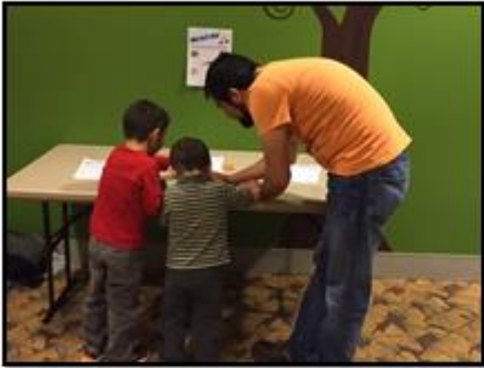
Shell Identification Station (Science/Technology)