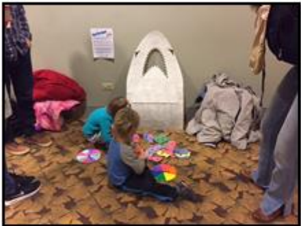
Feed the Shark Station (Math)