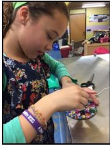
Making cd spinners