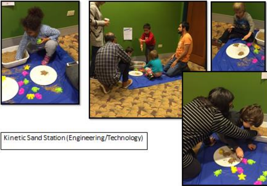
Kinetic Sand Station (Engineering/Technology)