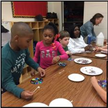
Making cd spinners