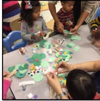
Making paper trees