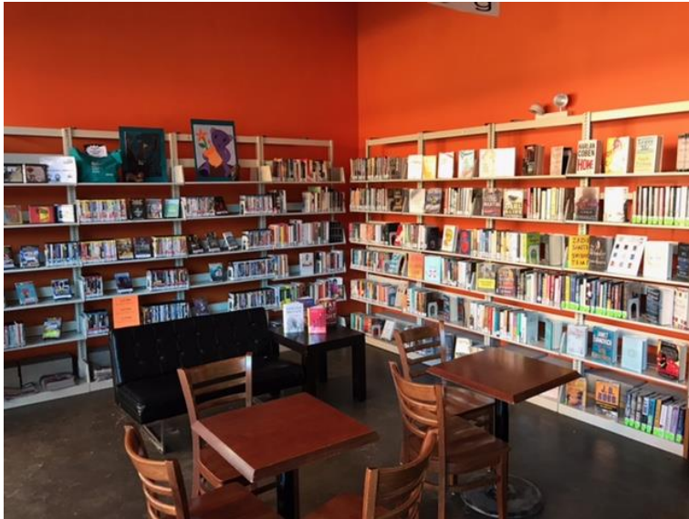
Adult Shelving at CAMS