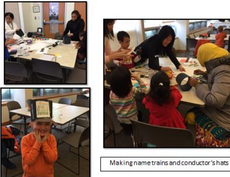
Making name trains and conductor's hats