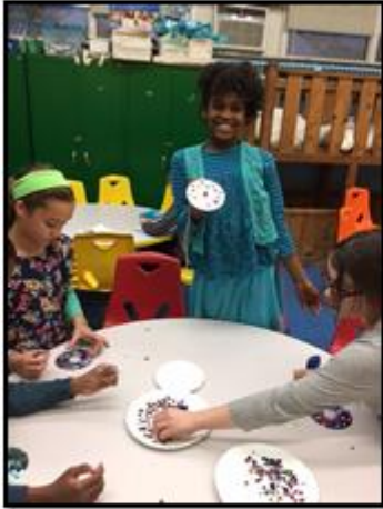
Dawes Aftercare K-5 th grade