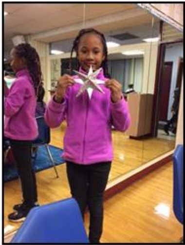
Fleetwood Afterschool 2 nd -3 rd grade