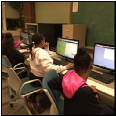
Hour of Code