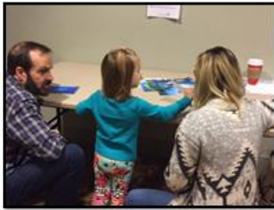
Living or Non-living Station (Math/Science)