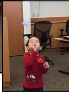
Air Pressure and Motion