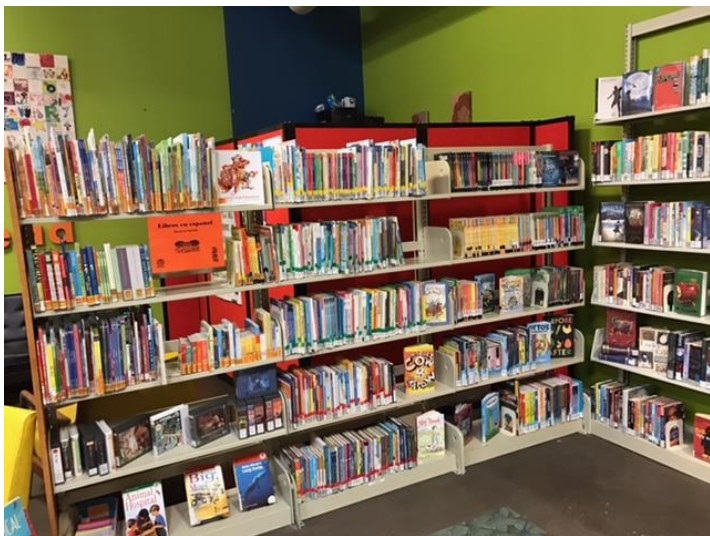
Juvenile Shelving at CAMS

Kerry Littel reorganized the shelving at CAMS to give us more space for popular items.