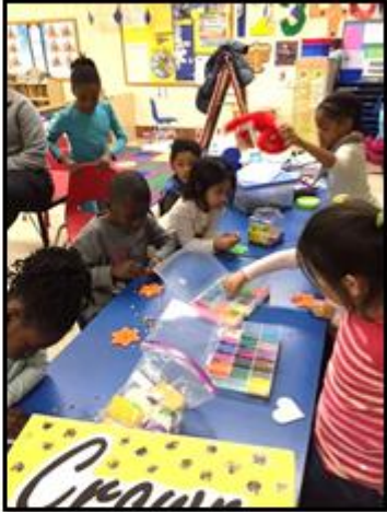
Designing with Perler beads