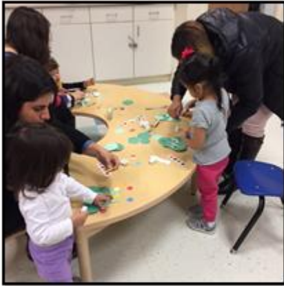
Learning & Growing PACT Activity – Family Center