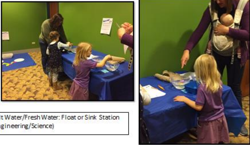
Salt Water/Fresh Water: Float or Sink Station (Engineering/Science)