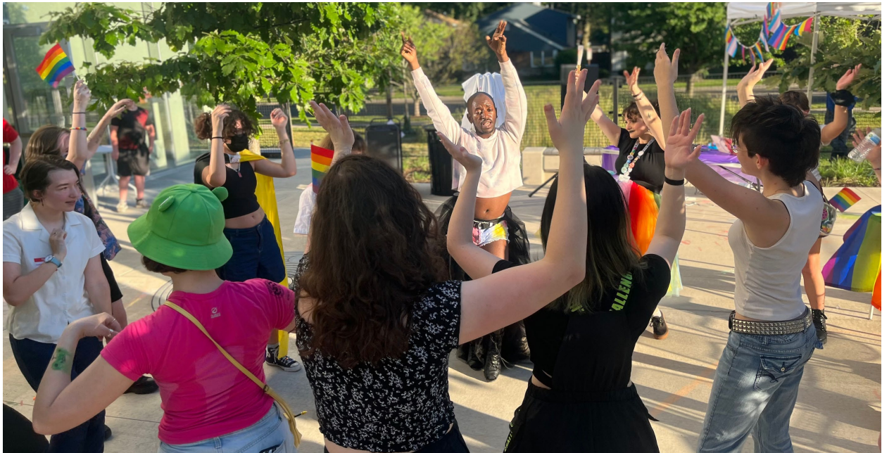
Our Pride Month programming celebrates the LGBTQIA+ community for all ages.

The Evanston Public Library strives to be a vibrant heart of our diverse community. Our mission is to foster the growth of independent, self-confident, and literate patrons, ensuring equitable access to a wealth of cultural, intellectual, technological, and informational resources. As we embark on this journey, we recognize and acknowledge past injustices for all minoritized groups. We are committed to evolving alongside our community, guided by five core values critical to our mission.