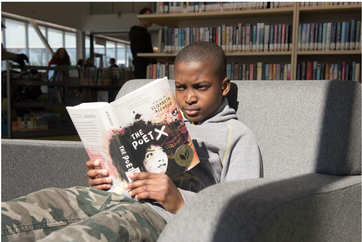
The Robert Crown Branch, co-located in the Robert Crown Community Center offers Evanston's west side residents access to programs and materials in walking distance.