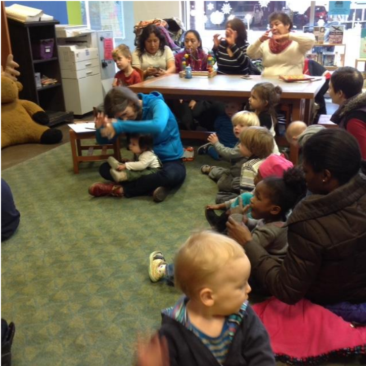
Note the parent and nanny participation in the photo above.