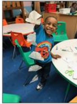
Celebrating MLK - portraits & peace doves