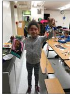
Celebrating MLK - portraits & peace doves