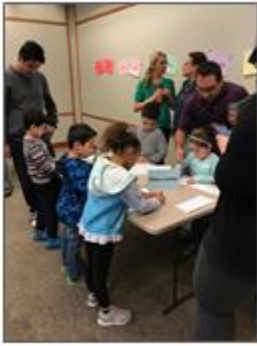
K-LEAP Let's Play Post Office