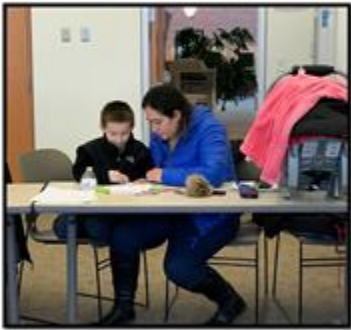
PACT Activity- JEH