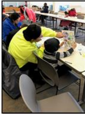
PACT Activity- JEH