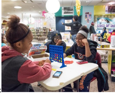
Table Top Game Night:

Starting in January we started a weekly drop in table top game night on Mondays. This program has been a big success so far. Several teens take part and they get just as into the board games as they do the video games. Chess, checkers, UNO and Connect Four are the most popular games. We have been leaving chess out all the time and teens enjoy playing each other or taking on EPL staff. We're working on recruiting a volunteer for this program who can play with the teens or encourage them to try and new game out that that they may not have played before.