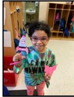
Strew rockets & butterflies