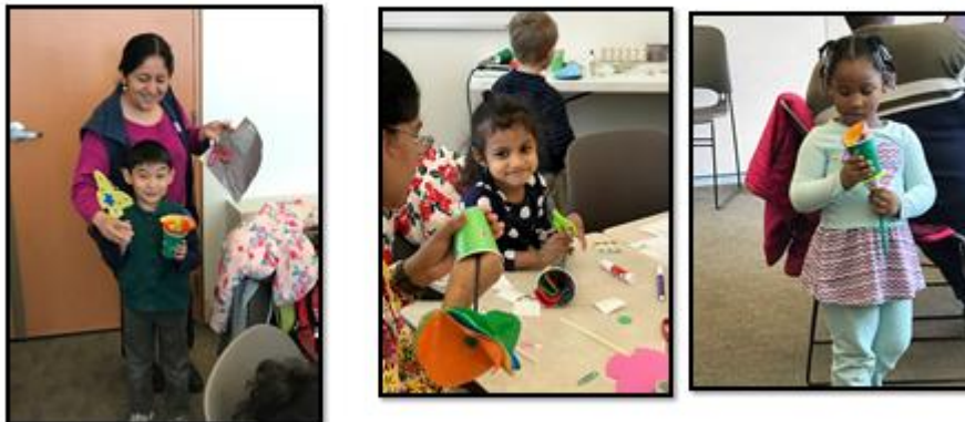
PACT Activity: Flowers and Butterflies- JEH