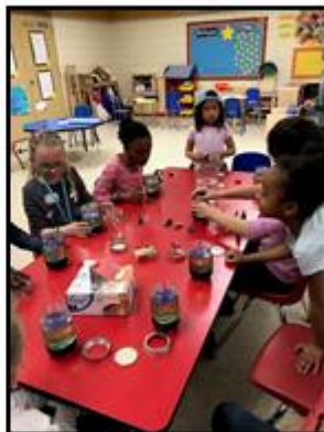
Meson Jer Leve Lamps