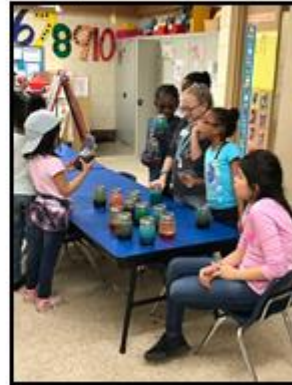
Mason Jar Lava Lamps