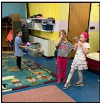
Straw rockets & butterflies