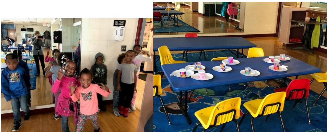
Fleetwood K-1st grade