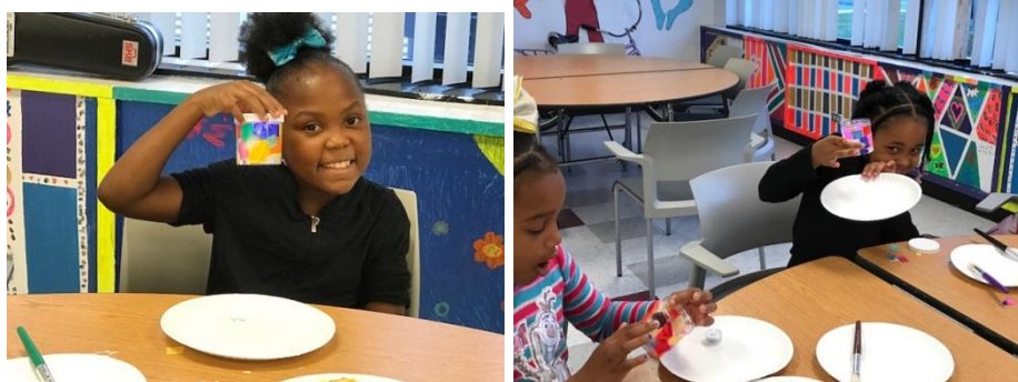
Fleetwood 2/3rd grade