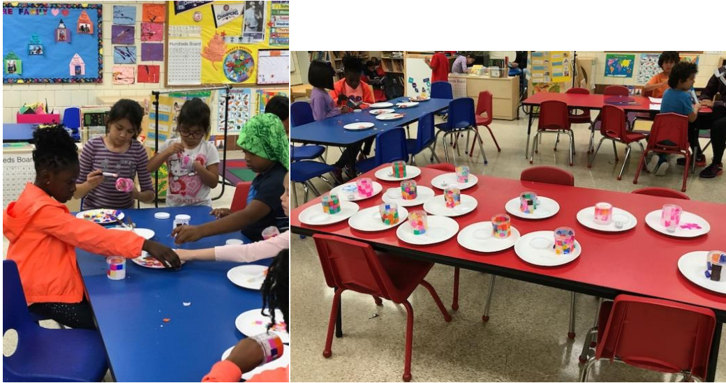
Robert Crown Afterschool