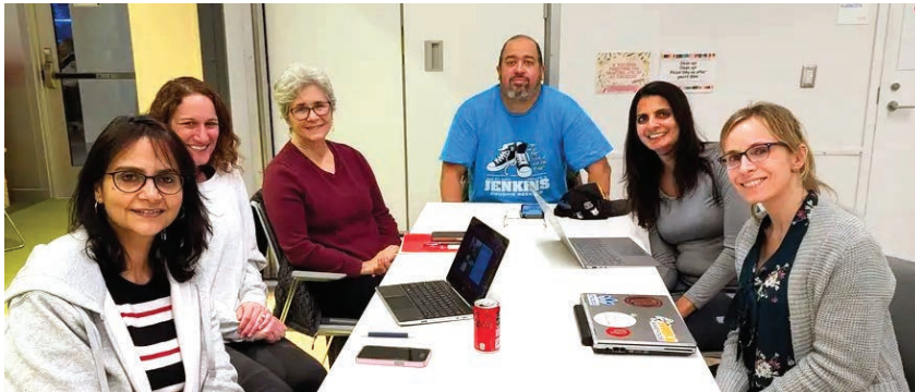
Members of the PEPL

Philanthropic and community support play a vital role in bringing the Evanston Public Library's mission to life. Community partners, volunteers, individual donors, foundations, and organizations enable EPL to expand access, deepen impact, and offer innovative programs that would not be possible through public funding alone. These investments fuel everything from early literacy and lifelong learning initiatives to arts programming, technology access, and social support ensuring that the Library remains a vibrant, equitable, and welcoming space for all who call Evanston home.